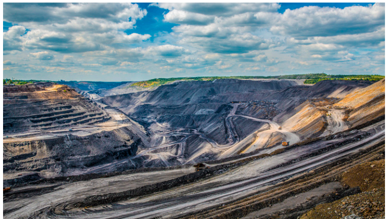
Mining is one example of the human impact on geodiversity. Active mines cause a decrease in local biodiversity, but in some cases they can provide an important habitat for specialized and rare species after the mine has been abandoned.

Although the current essential variables frameworks account for the biosphere, atmosphere, and some aspects of the hydrosphere (1–4), they largely overlook geodiversity—the variety of abiotic features